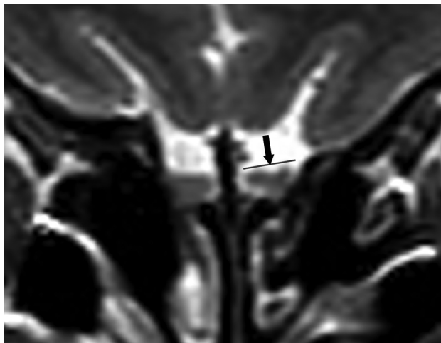
FIG 2. A 59-year-old female patient with idiopathic olfactory dysfunction with a threshold-discrimination-identification score of 14. Coronal T2WI shows olfactory bulb concavity (arrow) on the left side compared with the normal oval shape on the right side. The olfactory bulb heights and lateral diameters were 2.1 and 3.5 mm, respectively, on the right side and 1.3 and 3.5 mm on the left side.