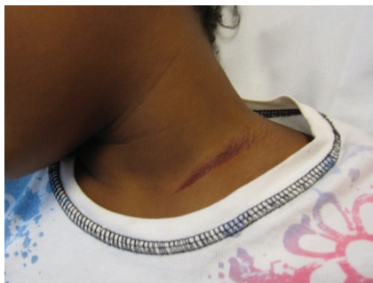
FIG 1. Cervical seatbelt sign. Dermal bruising at the base of the neck, just cephalad to the clavicle indicating injury by a seatbelt.

BCVI in children parallel those of adults, the other, in contradistinction, demonstrated that as many as two-thirds of patients experiencing stroke from BCVI did not meet screening criteria according to those used for adults. 9,10