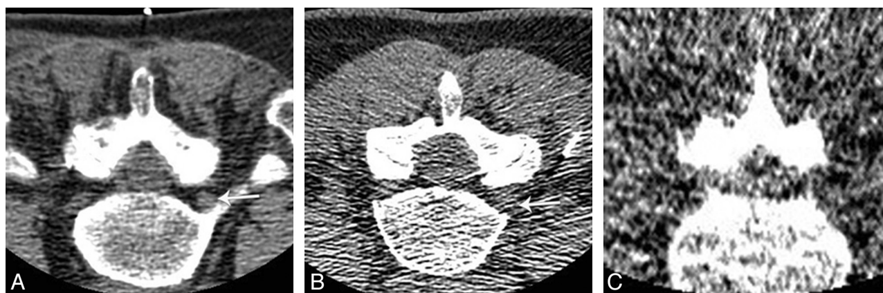
Fig 2. Image analysis score system. A , Grade II represented cases in which the exiting nerve root (arrow) was well delineated and confidently identified. B , Grade I represented cases in which the nerve root (arrow) was identified, but not confidently, and required image window and level manipulation or review of the planning CT images. C , Grade 0 represented cases in which the nerve root could not be identified.