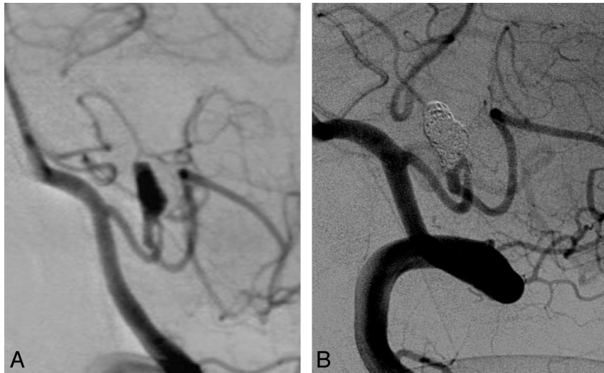
Fig 1. A 46-year old woman (patient 4; Table) experienced acute onset of headache. MR imaging and MR angiography showed a right-sided PICA aneurysm without any evidence of intracranial bleeding. In initial DSA (A), a 9- × 5.5-mm sidewall aneurysm was visualized in a tonsillomedullary segment of the right PICA. The artery is narrowed proximally and dilated distally to the aneurysm neck. A balloon occlusion test was performed with indeterminate findings. The aneurysm was treated by endosaccular coiling with parent artery preservation. The initial occlusion grade was incomplete, but after retreatment a complete occlusion was achieved, and it has remained stable during follow-up (Fig 2B).