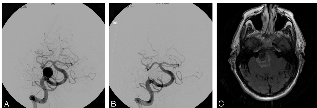
Fig 2. A, Pre-embolization angiogram showing a large basilar apex region aneurysm. B, Postembolization angiogram showing the coiled aneurysm with minimal residual neck. A large posterior communicating artery on the left produces washout of the left posterior cerebral artery. C, Axial flare MR image showing edema within the brain stem adjacent to the coiled aneurysm.

The development of hydrocephalus has also been well documented in cases of unruptured aneurysms following treatment with bioactive coils. 1-4 Some have proposed that the development of an aseptic meningitis and its inflammatory sequelae leads to a communicating form of hydrocephalus. 3 This would seem a plausible explanation for the hydrocephalus that developed in our first patient. The development of hydrocephalus in the same set of treated patients with ruptured aneurysms is more difficult to interpret because a substantial percentage of those patients will also develop hydrocephalus in the absence of endovascular therapy. In the recently completed HELPS (HydroCoil Endovascular Aneurysm Occlusion and Packing Study), early hydrocephalus (<3 months post coiling) occurred in a small number of randomized unruptured aneurysms in both arms of the trial with no significant difference identified between the HydroCoil and control arms ( p = 0.6 ) (unpublished data by P. White presented on behalf of HELPS trialists, World Federation of Interventional and Therapeutic Neuroradiology meeting, September 2007, Beijing, China).