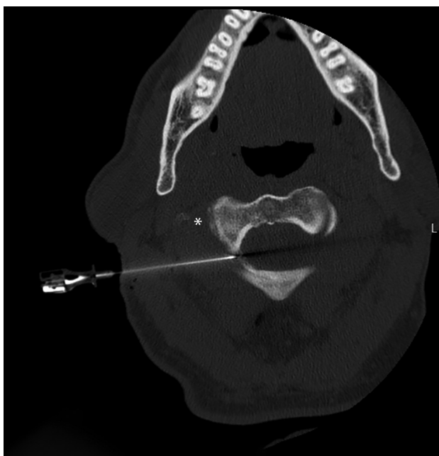
FIG 2. Intraprocedural axial CT image (patient 10) showing placement of a 22-ga RFA cannula at the expected location of the C2 DRG. The needle tip lies just above the C2 pedicle. The vertebral artery is safely located lateral to the C2 vertebral body at this level (asterisk).

is then performed using a 1:1 mixture of 1 mL preservative-free dexamethasone, 10 mg/mL, and 0.5% bupivacaine; the needle is removed and sterile dressing applied. Patients are observed for 1 hour and discharged home.