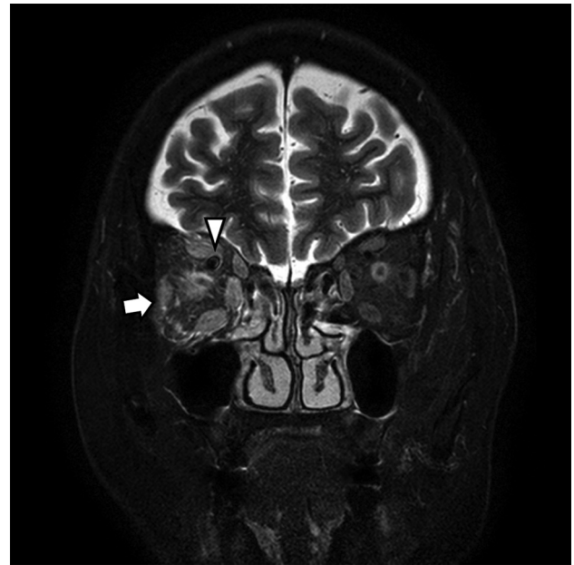
FIG 6. A CCF case with high signal change and orbital soft tissue thickening. Coronal T2-weighted image of a patient with periorbital swelling, conjunctival injection, ocular pain, and diplopia. Fat stranding and swelling of extraocular muscles ( arrow ) are noted. Prominent venous drainage flow in the superior ophthalmic vein is also noted ( arrowhead ). The patient was confirmed as having an indirect CCF on digital subtraction angiography.

presence of CCF were calculated. The secondary outcome was to determine possible imaging predictors for CCF on thin-section MR imaging. The Fisher exact test and univariable logistic regression analysis were used to determine possible predictors of CCF. The thin-section MR imaging characteristics of abnormal contour of the cavernous sinus, internal signal void of the cavernous sinus, prominent venous drainage flow (anterior/lateral/posterior), and orbital/periorbital soft tissue swelling were considered as potential adjustment variables. Statistical analyses were performed by using SPSS software (version 25.0; IBM), with statistical significance being defined as P < .05 .