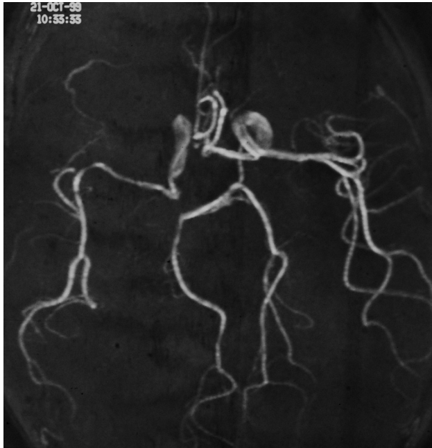
Fig 2. MR angiography of the patient at 2 years old shows a hypoplastic right siphon and middle cerebral artery, with a stenotic Sylvian bifurcation.