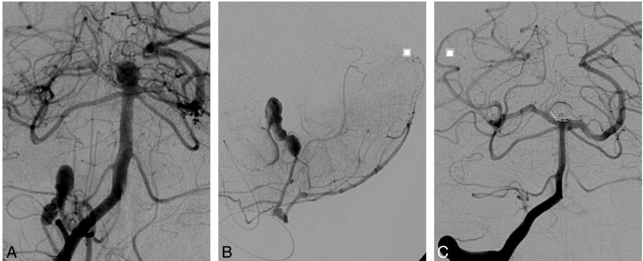
Fig 2. An 80-year-old woman (patient 10; Table) experienced severe vertigo with sudden onset. CT examination revealed a small right-sided intracerebral hematoma in cerebellar vermis, hemorrhage in the fourth ventricle, and prepontine cistern. Subsequent DSA revealed a dissecting aneurysm of the right PICA and a saccular aneurysm of the basilar tip (A). A superselective right PICA injection demonstrated an irregular, fusiform PICA aneurysm located in the cortical segment (B). Parent artery occlusion of the dissected cortical segment of PICA and coil embolization of the basilar tip aneurysm were performed in the same session. In control angiogram after the treatment, both aneurysms are occluded (C). Posttreatment CT showed PICA infarct, and the patient had temporary worsening of vertigo, but in 6 months of follow-up she recovered without any symptoms.

The most typical presentation of a dissecting PICA aneurysm is hemorrhage, which has been reported to account for two thirds of the cases. 15 In the present series, all 7 of the dissecting aneurysms were ruptured, and 3 (43%) of them rebled early before endovascular treatment. Angiographic progression was detected in 5 cases of the ruptured dissecting aneurysms eligible for repeat angiography before the treatment. These findings are in concordance with earlier observations and support the necessity of early treatment to prevent rebleedings. 5,29 During the present series, the mean delay from initial bleeding to endovascular treatment was 12 days, which is significantly longer than in cases of ruptured saccular aneurysms in our hospital. 30 The prolonged delay is partly due to the poor clinical condition of the patient in many cases. On the other hand, limited knowledge regarding the optimal treat-