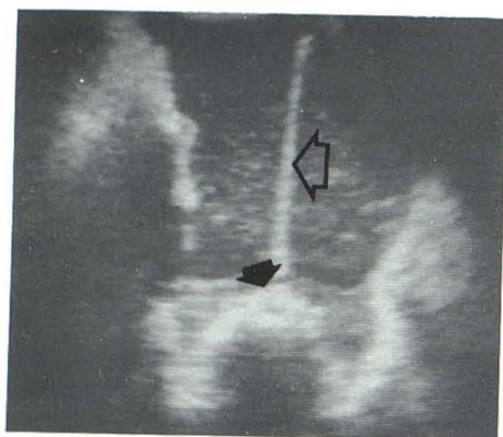
Fig. 1.—Case 1. Transverse intraoperative sonogram of L4–L5 laminectomy site. Microbubbles in saline bathe dural sac. Metal cannula (open arrow) demarcates dural interface (solid arrow), which is thickened and impedes acoustic signal to further through-transmission.

Initially, microbubbles were prominent in the water bath of the surgical site, but after a few minutes they resorbed to produce a clear space above the dural sheath. It was not necessary to actually put the transducer on the dural sheath