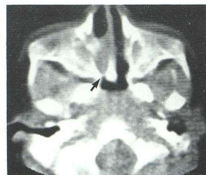
Fig. 5.—Unilateral choanal atresia in 4-month-old infant. Thin bony plate with thick membranous component on right (arrow).

smell, and repeated infections. Right-sided choanal atresia has been reported as more common than left-sided or bilateral atresia in some series [4, 7–10], whereas others claim that the incidence of unilateral and bilateral atresia is equal [1, 2] or that bilateral atresia is more frequent [5, 6]. In our series of 11 patients, six cases were bilateral; of the five unilateral cases, three were on the right.