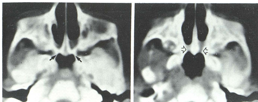
Fig. 4.—Bilateral choanal atresia in 4-month-old infant. A , After suctioning. Thick bony atretic component bilaterally (arrows). B , 5 mm lower. Membranous component (open arrows).