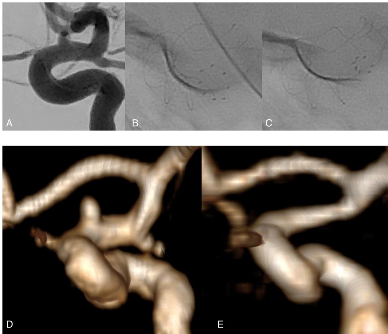
FIG 3. A, Intraprocedural DSA of the aneurysm on the left ICA. B and C, Fluoroscopy images of the stent, which illustrate the progressive narrowing and stenosis of the distal part of the implant. We can see a notable deformity on the 14-day single-shot (C), compared with the procedural image of the implant (B). The images of the deformity correlate well with the conducted follow-up MRI. We highlight a noticeable reduction of diameter of the distal ICA on follow-up (E), when compared with the pretreatment 3D-TOF reconstruction of the artery (D).