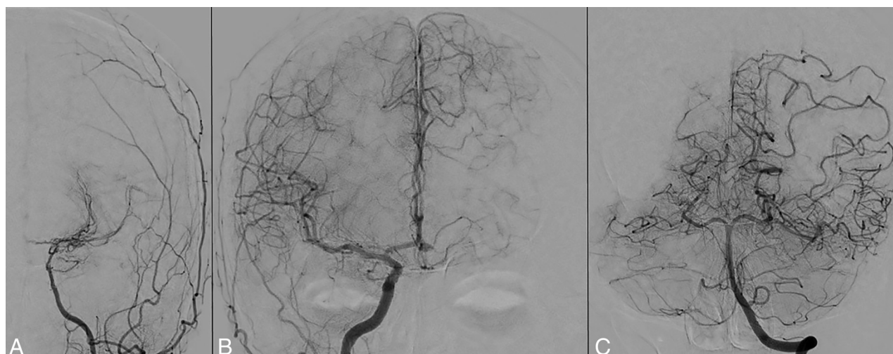
FIG 2. Six-month DSA control performed on the patient (anteroposterior projections). A severe narrowing of the distal left ICA in the segment of the placed FD and reduced blood flow in the left middle and anterior cerebral arteries can be seen (A). These findings correlate with the symptoms observed in the patient in the first month postprocedure. A compensatory development of leptomeningeal collaterals, collaterals from the posterior circulation and the right ICA, is the probable cause for the lack of vascular incidents during that time (B and C).

the patients enrolled in the study. A statistically significant ( P < .05 ) association was observed between the seen stent deformity and a postprocedural novel unilateral headache on the side of the placed stent in the brain circulation. This symptom spontaneously resolved in all patients at the 6-month follow-up.