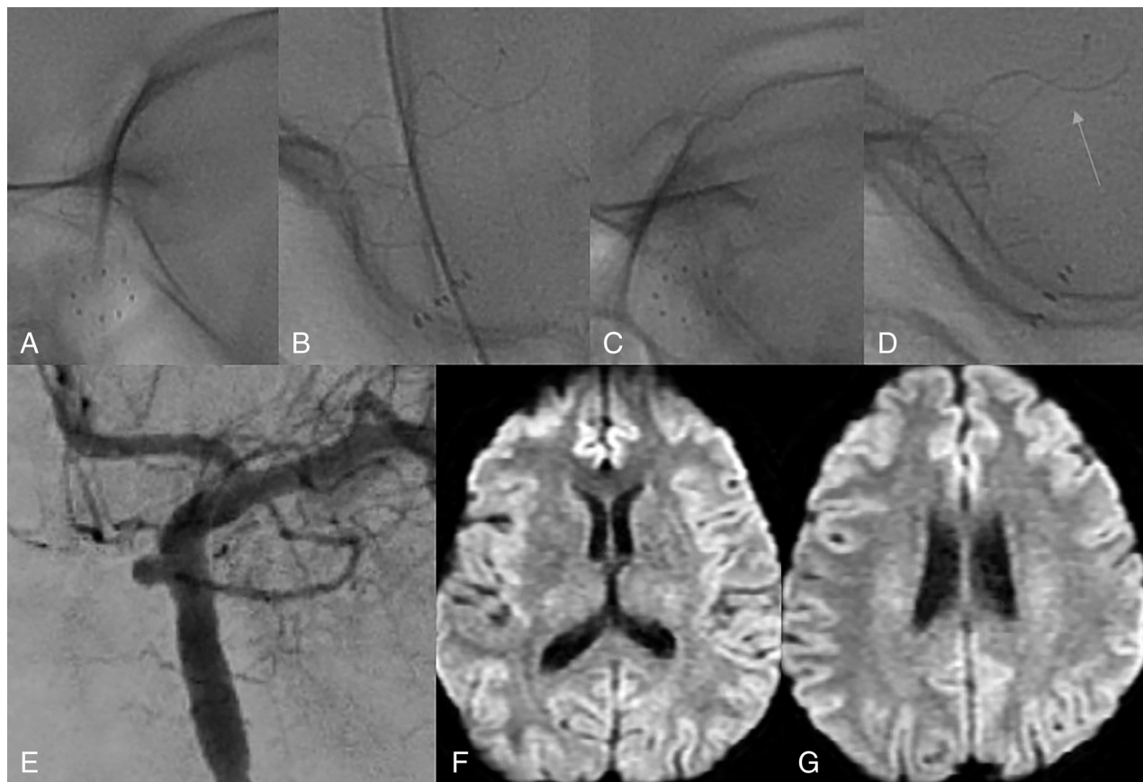
FIG 1. A and B, antero-posterior (AP) and lateral projections of a single-shot image of the stent on discharge. No deformity was observed. C and D, Single-shot images of the stent 14 days after the procedure, after the onset of symptoms. A noticeable narrowing and elongation of the distal part of the stent can be seen (orange arrow). This observation is concurrent with our observation of the carotid artery's reaction to the implant. Because this case is the one in which our patient exhibited acute symptoms from the occurrence, we believe it is extremely illustrative for our point to come across. E, AP projection of the intraprocedural DSA performed prior to the implantation of the FD stent. A saccular aneurysm of the ophthalmic segment of the left ICA was the target of treatment. F and G, DWI MRI sequence, which was performed after the initial onset of right-sided weakness with which the patient presented. No acute ischemic changes in the brain parenchyma can be seen, which led us to believe that the changes in the cerebral blood flow were transient in nature.

The collected data were analyzed by using SPSS (Statistical Package for the Social Sciences) Version 29.0. The statistical methods applied to the study were: descriptive statistics, Fisher exact test, and Spearman rank correlation. Kolmogorov-Smirnov and Shapiro-Wilk tests were used to test the normal distribution of the data. The level of accepted significance was noted as \alpha = 0.05 , defined as P < .05 .