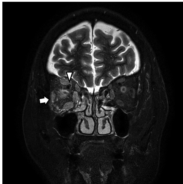
FIG 6. A CCF case with high signal change and orbital soft tissue thickening. Coronal T2-weighted image of a patient with periorbital swelling, conjunctival injection, ocular pain, and diplopia. Fat stranding and swelling of extraocular muscles ( arrow ) are noted. Prominent venous drainage flow in the superior ophthalmic vein is also noted ( arrowhead ). The patient was confirmed as having an indirect CCF on digital subtraction angiography.

presence of CCF were calculated. The secondary outcome was to determine possible imaging predictors for CCF on thin-section MR imaging. The Fisher exact test and univariable logistic regression analysis were used to determine possible predictors of CCF. The thin-section MR imaging characteristics of abnormal contour of the cavernous sinus, internal signal void of the cavernous sinus, prominent venous drainage flow (anterior/lateral/posterior), and orbital/periorbital soft tissue swelling were considered as potential adjustment variables. Statistical analyses were performed by using SPSS software (version 25.0; IBM), with statistical significance being defined as P < .05 .