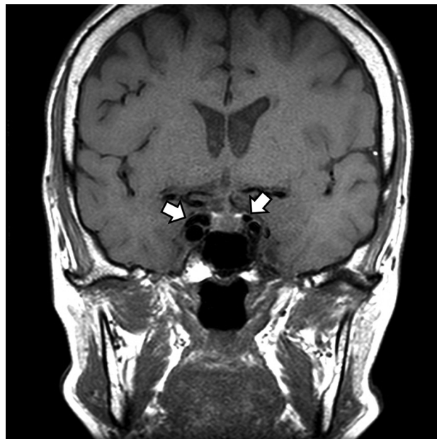
FIG 3. A CCF case with internal signal void of the cavernous sinuses. Coronal T1-weighted image of a patient with diplopia, confirmed to be right third cranial nerve palsy on neurologic examination. Note the internal signal void in both cavernous sinuses visible on T1-weighted image ( arrows ). The patient was confirmed to have an indirect CCF on digital subtraction angiography.

Signal void was evaluated on both T1- and T2-weighted MR imaging. Prominent venous drainage flow was considered positive if the superior or inferior ophthalmic vein (anterior), sphenoparietal sinus (lateral), or superior or inferior petrosal sinus (posterior) was prominently or asymmetrically enlarged with or without signal void (Figs 4 and 5). Orbital/periorbital soft tissue swelling was considered positive if there was high signal change and extraocular muscle thickening on T2-weighted MR imaging (Fig 6). The overall diagnosis (presence or absence of CCF) was also evaluated for each case, and the diagnostic performance of thin-section MR imaging was estimated.