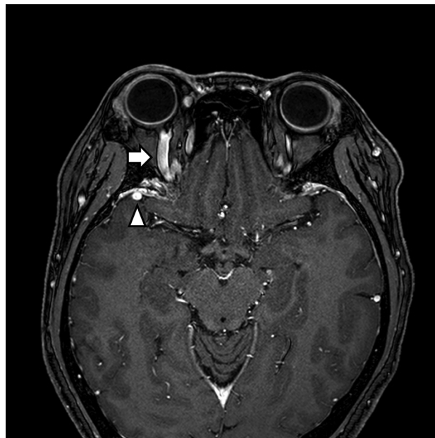
FIG 4. A CCF case with prominent venous drainage flow in the anterior and lateral venous structures. Axial contrast-enhanced T1-weighted image of a patient with right ocular pain and conjunctival injection. Note the enlarged right superior ophthalmic vein (anterior; arrow ) and right sphenoparietal sinus (lateral; arrowhead ). The patient was confirmed as having an indirect CCF on digital subtraction angiography.

This study had 2 main outcomes. The primary outcome was the diagnostic performance of thin-section MR imaging for the diagnosis of CCF with the reference standard being DSA. The