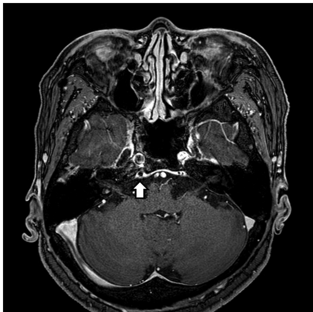
FIG 5. A CCF case with prominent venous drainage flow in the posterior venous structure. Axial contrast-enhanced T1-weighted image of a patient with diplopia, confirmed to be right sixth cranial nerve palsy on neurologic examination. Note the enlarged right inferior petrosal sinus (posterior) with an internal signal void ( arrow ) indicating increased flow rate. The patient was confirmed as having an indirect CCF on digital subtraction angiography.