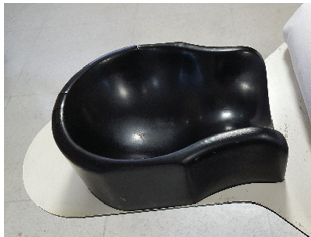
FIG 1. Rigid and radiolucent head holder.

Before each intervention, a Foley catheter and 2 intravenous lines were inserted in each patient in the intensive care unit. For a further reduction of head motion during the intervention, a custom-made, rigid, radiolucent headholder attached to the angiography table was used (Fig. 1). Electrocardiography, blood pressure cuffs, and pulse oximetry were applied throughout the procedure to monitor the patients. For real-time clinical assessment, frequent neurologic examinations (motor, sensory, and speech) were performed. In all procedures performed with the patient under local anesthesia, conscious sedation, or deep sedation, to