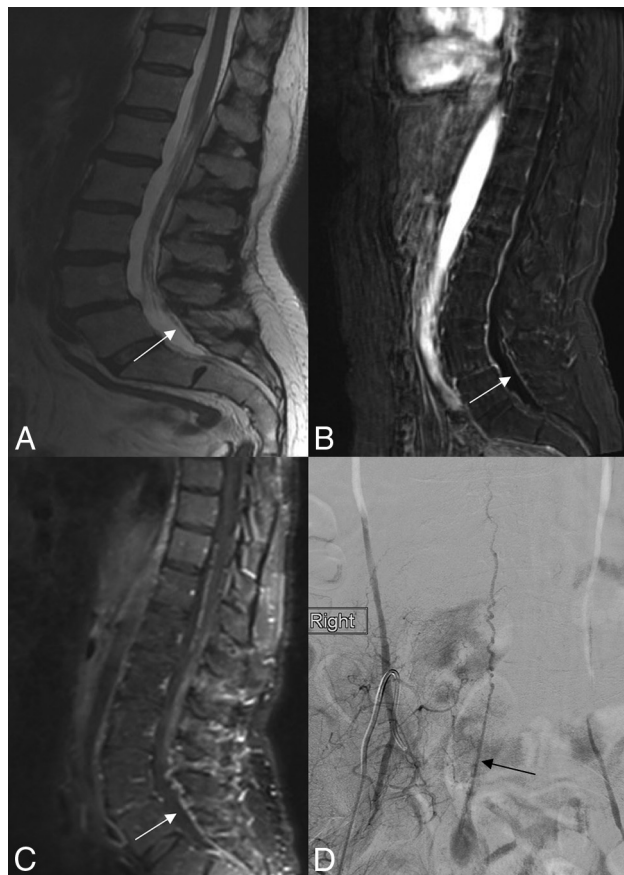
FIG 2. A 75-year-old man with a sacral dural arteriovenous fistula at S1. A, Sagittal T2-weighted MR imaging shows a dilated vein of the filum terminale (white arrow). B and C, Contrast-enhanced MRIs demonstrate marked dilation of the vein of the filum terminale (white arrow). D, Conventional angiogram in the anteroposterior plane following injection into the right internal iliac artery demonstrates a fistula at S1 with a dilated vein of the filum terminale (black arrow).

sagittal T2-weighted MR imaging. The presence of such a vein prompted the investigators to pursue pelvic angiography before thoracolumbar angiography, resulting in prompt identification of the fistulous point. 12 In a more recent series of sacral fistulas by Gioppo et al, 16 the authors found that all 15 sacral fistulas had an enlarged VFT on MR imaging. Meanwhile, a recently published series of spinal vascular malformations at the L5 level or below found that 60% of fistulas had a dilated filum terminale vein, further reinforcing the association between a dilated VFT and the presence of a deep lumbar or sacral fistula. 13 Our study differs from these prior studies because we are able to confirm that a dilated VFT identified using conventional