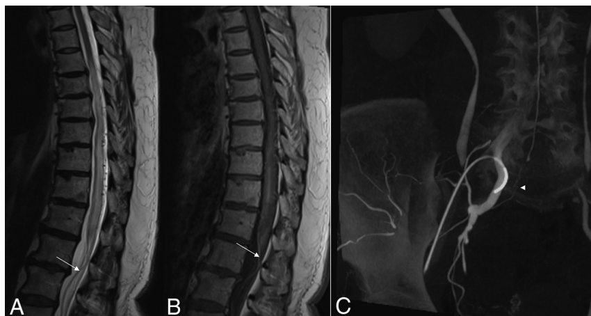
FIG 1. A 63-year-old woman with a sacral dural arteriovenous fistula at S1. A , Sagittal T2-weighted MR imaging shows a dilated vein of the filum terminale (white arrow). B , Contrast-enhanced T1-weighted MR imaging again demonstrates the dilated vein of the filum terminale (white arrow). C , Rotational digital subtraction angiogram reformatted in the coronal plane following injection into the right internal iliac artery demonstrates a fistula at S1 (arrowhead), with a dilated vein of the filum terminale.

nal dural AVF such as the location of cord edema or the epicenter of the dilated perimedullary vessels cannot provide information about the location of the fistula, 2 there have recently been a few case reports and smaller case series suggesting an association between a dilated vein of the filum terminale (VFT) and a deep lumbar or sacral AVF. 12,13 We thus performed a retrospective review of SDAVFs and SEDAVFs from 2 tertiary referral centers to test the hypothesis that a dilated VFT, identified as a curvilinear midline flow void on T2WI or a dilated contrast-enhancing vessel below the conus on T1-weighted postcontrast images, is an imaging marker for a lower lumbar (L3–L5) or sacral fistula.