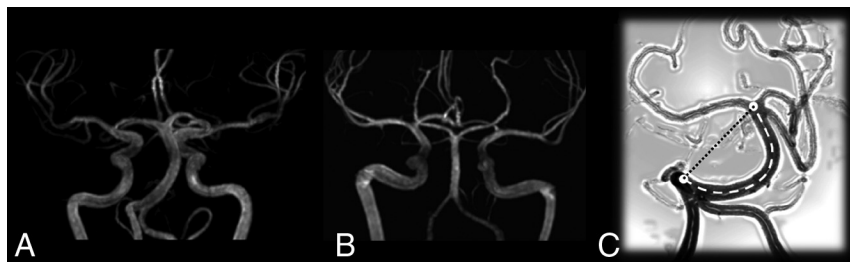
FIG 1. MIP of an MRA study in A, a 41-year-old male patient with FD and B, a control patient. Note a mild increase of the tortuosity of the basilar artery and a more evident increase of the lumen diameter (compare the basilar artery with the contiguous ICA) C, Drawing of a tortuous basilar artery showing the real curved length ( dashed line ) and the linear distance between the basilar artery extremes ( dotted line ).

applied different quantification methods or semiquantitative scores for the severity of the intracranial FD-related vessel changes, leading to conflicting results about the role of sex, age, and treatments.