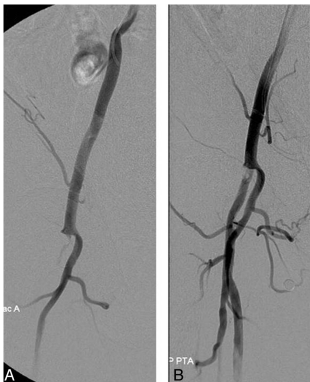
FIG 2. Right common iliac artery angiogram showing occlusion at the common femoral artery (A) and revascularization after angioplasty (B).

man had undergone carotid angioplasty and stent placement for a symptomatic high-grade stenosis of the carotid artery. No obvious local abnormality was shown on the angiogram before deployment of the closure device, but the pedal pulse was found to have diminished a few hours later. An angiogram showed an occluded common femoral artery at the puncture site. Flow was restored following balloon angioplasty (Fig 2). Anticoagulation was maintained for 24 hours, and no change in flow was apparent by sonography and during clinical follow-up. Despite the complication, there was no delay in the discharge of this patient.