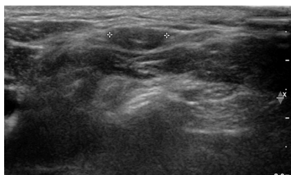
FIG 2. A 39-year-old female patient who underwent total thyroidectomy. The patient had a palpable lymph node (cross) in level V and no suspicious US feature. Even though the lymph node had inadequate FNA cytology due to a few hemosiderin-laden macrophage and lymphoid cells, it was considered benign because of its low FNA-Tg level. The node showed no changes in a 2-year follow-up. According to our results, there was no significant diagnostic enhancement of FNA-Tg in patients without suspicious US findings.

cutoff, which is widely regarded as 10, and the serum Tg level cutoff, considered as 2, leading to an increased chance of misdiagnosis. Using our cutoff value, we think that such confusion