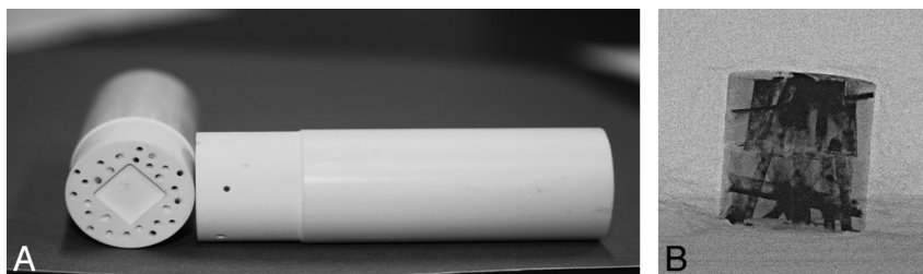
Fig 1. A, Cylindric AVM model: a plastic water phantom with a tubular perforation (model A). B, X-ray radiography of the model B showing the radiopacity of the embolic agent. The film is positioned in the center of the phantom.