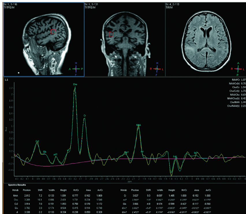
Fig 3. Patient with PML (voxel = 15 \times 15 \times 15 mm). NAA/Cr = 0.78 , Cho/Cr = 1.73 , NAA/Cho = 0.45 , Cho/NAA = 2.23 .

noid receive coil. Another obstacle is the fact that peak separation is reduced at a lower B_0 , thus potentially making spectral peak overlap and water suppression more of a challenge. On the basis of the measured peak widths and the flat