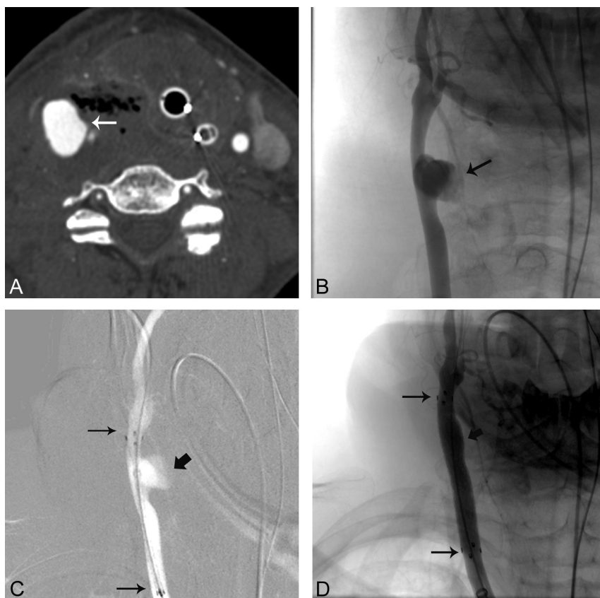
Fig 1. A 51-year-old woman with glottic and hypopharyngeal cancer who presented with hemoptysis (On-line Table). A, Axial contrast-enhanced CT scan of the neck shows extravasation from the RCCA (arrow) with surrounding air. B, AP RCCA angiogram shows the area of extravasation (arrow). C, AP roadmap of the RCCA shows placement of a covered stent (long arrows) across the area of extravasation (short arrow). D, AP RCCA angiogram after covered stent (long arrows) placement shows no evidence of extravasation (short arrow).

similar to those of the initial CBS presentations (On-line Table).