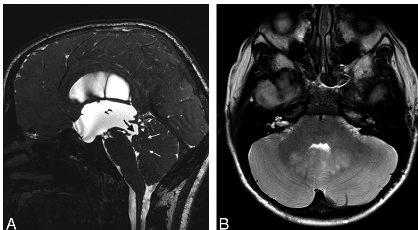
Fig 3. A, Midsagittal 3D-CISS image of a 10-year-old boy with NF-1 demonstrates severe triventricular hydrocephalus. The cerebral aqueduct is wide open (black arrow). The tectum (white arrowheads) is thin and displaced posteriorly. However, the fourth ventricle inlet is obliterated due to hamartomas filling the ventricle (white arrows). B, Axial TSE T2 image obtained through the midbrain reveals extensive cerebellar hamartomas mostly in the cerebellar vermis.

derstood and has not been investigated adequately, to our knowledge. Also, the clinical significance and the biologic behavior of hamartomas are yet to be clarified; at least we know that hamartomas or focal areas of signal intensity adjacent to the cerebral aqueduct or the fourth ventricle inlet cause hydrocephalus in the course of NF-1.