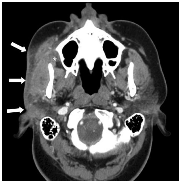
Fig 1. Axial contrast-enhanced CT scan shows diffuse, ill-defined inflammatory infiltration (white arrows) of the subcutaneous fat superficial to the masseter muscle and parotid gland. This extends into the pterygomaxillary fissure (asterisk), the parotid gland, and the masseter muscle. The process extends both superficial and deep to the platysma muscle and into the posterior buccal space fat.

There were mildly enlarged right intraparotid and level II lymph nodes and scattered bilateral shotty cervical lymph nodes, more prominent on the right side. The left parotid and submandibular salivary glands appeared normal. Extranodal lymphoid tissue in the Waldeyer ring and thyroid gland also appeared normal.