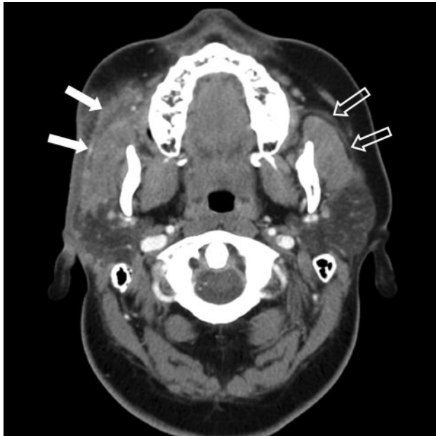
Fig 2. Axial contrast-enhanced CT scan shows ill-defined fat plane between the muscles. The proximal right parotid duct (white arrows) is embedded within the lesion. Note normal left parotid duct (outlined arrows). Note flattened right facial contour, reduced bulk of right-sided subcutaneous fat compared with the left.