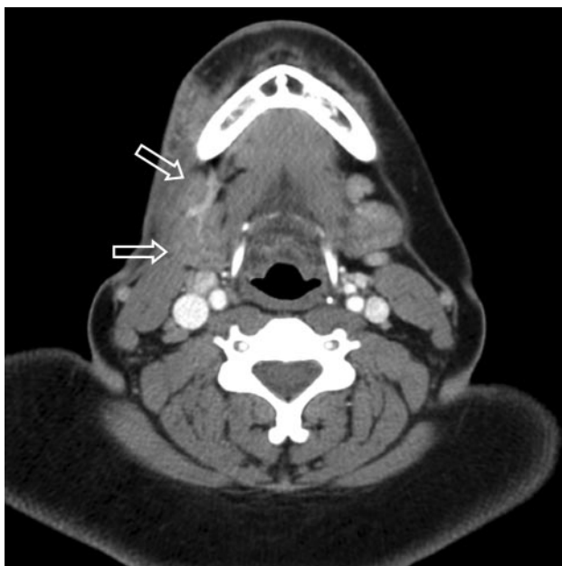
Fig 3. Axial contrast-enhanced CT scan at an inferior level shows extension of the infiltrative lesion into the right submandibular space obscuring the fat surrounding the right submandibular gland. Note that the lesion produces an indrawing cicatrizing effect rather than an outward bulge.

panniculitis with hyaline necrosis of the fat and presence of lymphoid follicles, occasionally with germinal centers. 6 Older lesions may contain calcifications. More than half of the cases demonstrate changes characteristic of LE in the dermis and epidermis, with epidermal atrophy, vacuolar degeneration of the basement membrane, and perivascular and periadnexal lymphocytic infiltrates. These findings are more frequent when the lesions are associated with discoid lupus. 5 Ackermann et al 7 divided the histopathologic features of LEP in 3