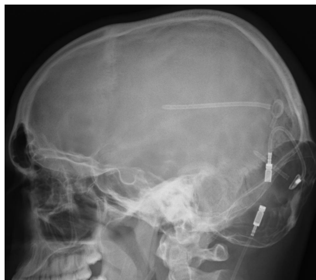
Fig 2. Lateral skull radiograph performed in our patient at age 15 years shows development of intradiploic cyst of the occipital bone.

and the expansion of the diploic space extending from the supraoccipital into the basioccipital part of the occipital bone, including the occipital condyle and lower clivus (Fig 3).