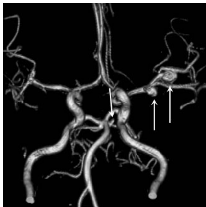
Fig 5. Five-year MRA follow-up in a 42-year-old woman with a coiled right middle cerebral artery aneurysm demonstrates 2 left middle cerebral artery aneurysms and a superior cerebellar artery aneurysm (arrows) without available previous imaging. The 2 middle cerebral artery aneurysms were clipped.