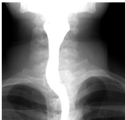
Fig 2. Frontal spot film of a barium swallow shows a normal anatomy of the pharynx and the upper esophagus with no evidence of a fistula.

pressed or immunocompromised patients. 3,6-8 A study from Nigeria of 84 women with endemic goiters demonstrated that acute thyroiditis occurred in 10.7% of the patients. In this study, the most common causative agent was Staphylococcus aureus . Less often Streptococcus pyogenes and Pseudomonas organisms were the offending agents. 1