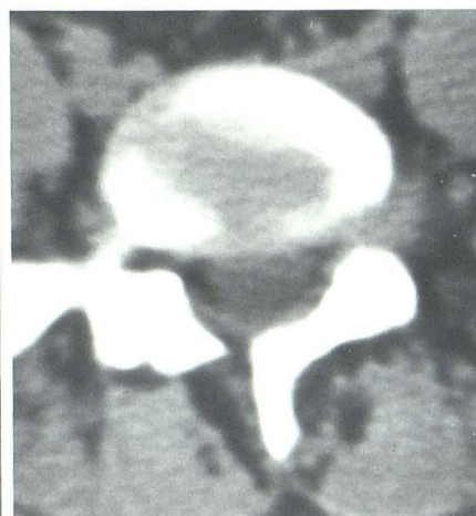
Fig. 4.—Case 4. Extraforaminal mass, compatible with left L5–S1 disk herniation. Epidural fat around thecal sac is preserved, while it is obliterated within left nerve root.