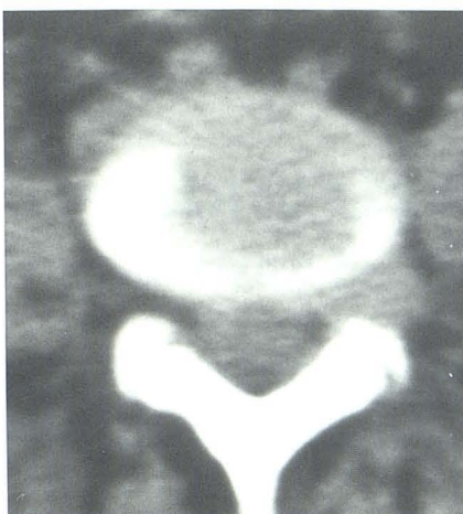
Fig. 3.—Case 3. Left-sided extraforaminal soft-tissue mass compatible with L4–L5 disk herniation. Disk herniation extends toward spinal canal, explaining why metrizamide myelogram demonstrated small extradural defect.