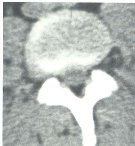
Fig. 2.—Case 2. Extraforaminal herniated L4–L5 disk (A) and L3–L4 disk (B). Soft-tissue masses are contiguous with disks. Both disk herniations are partially calcified, although L3–L4 disk calcification is more pronounced at different imaged section. Myelography was normal.

facetectomy uncovered a large extraforaminal disk herniation which was evacuated. The patient has slowly but progressively recovered muscle strength over a 3 month period.