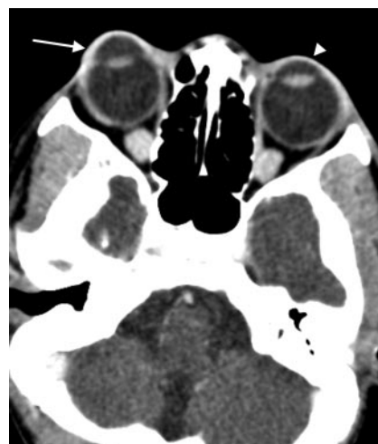
Fig 1. Axial CT image through the orbits after administration of intravenous (IV) contrast medium, which demonstrates a markedly enlarged anterior chamber of the right globe (arrow) and mildly enlarged anterior chamber of the left globe (arrowhead).

Opitz syndrome is a rare autosomal disorder caused by a defect in cholesterol metabolism. It is a heterogeneous disorder ranging from lethality to minor abnormalities. The abnormalities involve multiple systems including mental retardation; structural brain abnormalities; craniofacial abnormalities; and abnormalities of the heart, bowel, liver, lung, extremities, and genitalia. The ophthalmologic findings described have in-