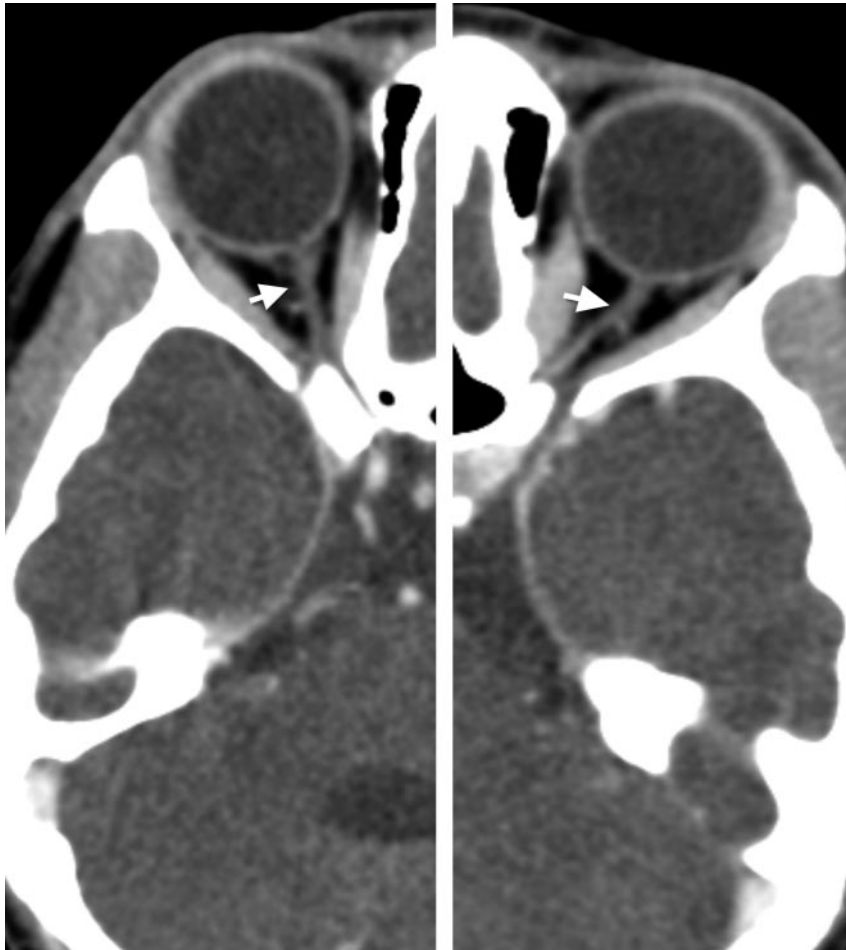
Fig 4. Axial CT images through the optic nerve after IV contrast medium showing bilateral optic nerve atrophy (arrows).