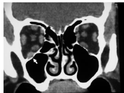
Fig 2. Coronal reconstruction contrast-enhanced CT scan demonstrates enlargement of the right maxillary nerve (arrow).

nant soft-tissue tumors. 2,3 These lesions have a tendency to affect the trunk and extremities, and only 10% of all MPNSTs are located in the head and neck region. 2 The most common nerve affected is the sciatic nerve, followed by the brachial plexus. 2 Between 38%–50% 3,4 of these malignant tumors are associated with NF-1, and this entity is also related to multiplicity. 3,4 The risk for developing an MPNST is 4600 times greater in patients with NF-1 than in the general population. 4