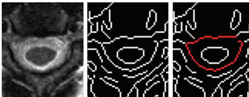
Fig 2. Cervical canal identification and quantification. Left , Original cervical T2WI. Center , Edge-detection image. Right , Spinal canal edge identified by operator.

The reproducibility of spinal cord measures was calculated as coefficients of variation ( [\text{SD}/\text{mean}] \times 100 ). For all of the reproducibility measurements, scans from 5 MS patients and 5 NCs were used. The patients were stable from both clinical and MR imaging points of view during this interval. The scan-rescan reproducibility was defined as the variability between the estimates of cervical cord atrophy measures determined on 2 separate MR imaging scans within 1 week and measured 5 times by a single blinded observer. Intrarater reproducibility was defined as the variability between mean estimates of spinal cord atrophy measures determined 5 times by a single observer who repeatedly evaluated the same scan obtained from the same subject. Interrater reproducibility was defined as the variability between mean estimates of spinal cord atrophy measures determined 5 times by 2 observers who repeatedly evaluated the same scan obtained from the same subject.