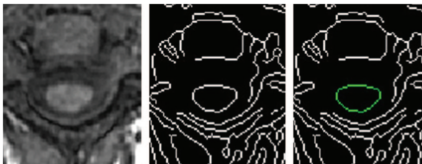
Fig 1. Cervical cord identification and quantification. Left, Original cervical 3D SPGR-T1WI. Center, Edge-detection image. Right, Cord edges identified by operator.

spinal cord atrophy in MS may be assessed by measurement of the whole cervical cord volume rather than by the traditional cross-sectional area approach at level C2/C3. To improve the accuracy and precision of cervical cord volume measurements, a semiautomated edge detection technique was used to create a tissue-boundary map from 3D volumetric scans of the cervical cord. Therefore, the objectives of the present cross-sectional study were first to validate this original method for measuring whole cervical cord volume by comparing 19 normal control subjects (NCs) and 65 patients with MS with different disease subtypes. We also evaluated the relationship between absolute and normalized cervical cord atrophy and clinical disability in the presence of other conventional and nonconventional brain MR imaging metrics using a unique additive variance regression model.