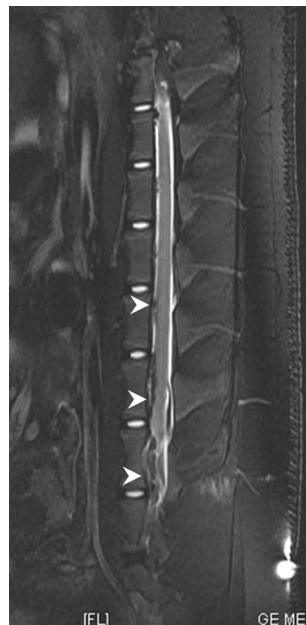
Fig 1. Sagittal FSE T2-weighted MR image (TR/TE, 4000/110 ms) scanned 30 minutes after ozone (10 mL, 90 \mu g/mL) injection into the subarachnoid space shows gas (white arrowheads) in the subarachnoid space. There are no signal intensity changes in the spinal cord.

The appearance of the spinal cords was grossly normal. There were no swelling, adhesion, discoloring, and tarnishing. The vessels of the dural sac were vivid and visible. The color and texture of nerve roots were normal in appearance (Fig 3).