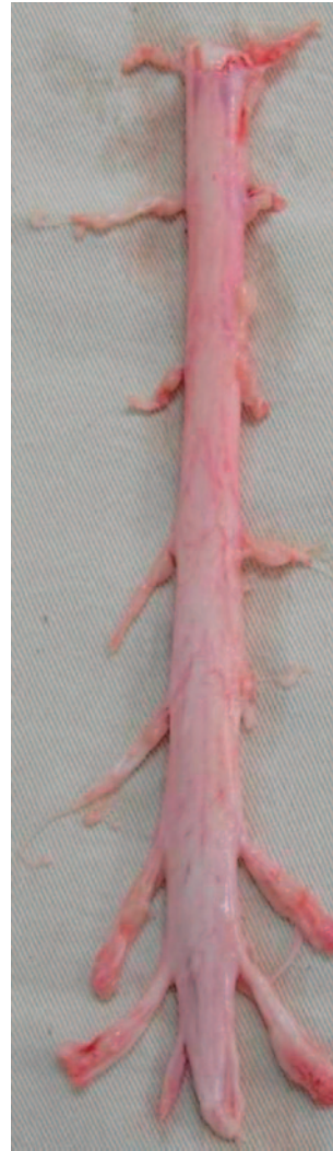
Fig 3. Animals were sacrificed 1 week after ozone (10 mL, 90 \mu g/mL) injection into the subarachnoid space, and the spinal cord was obtained. The appearance of the spinal cords is normal. There is no discoloring or tarnishing, and the vessel is vivid and visible.

rather with repeated puncture. We speculate that the hyperemia is correlated with repeated sampling of CSF before animal sacrifice.