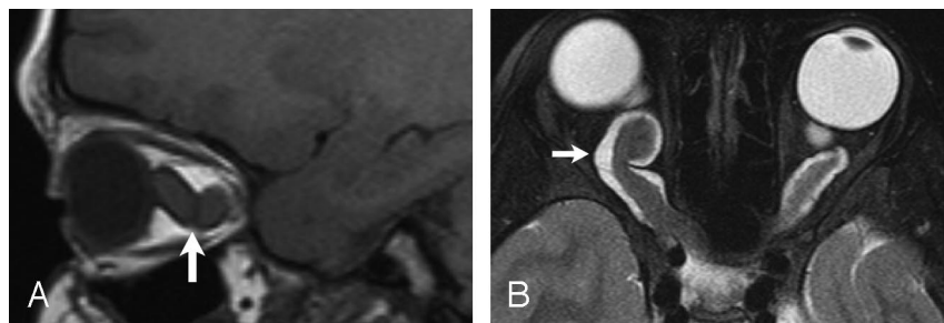
Fig 1. Optic glioma.

A, Sagittal spin-echo image (TR, 643 ms; TE, 12 ms) shows markedly enlarged optic nerve (arrow).