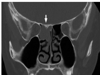
Fig 3. Coronal CT image in a patient with inverted papilloma shows localized cone-shaped hyperostosis of the superior wall of the posterior ethmoid sinus (white arrow). Intraoperative endoscopic examination confirmed that the origin of tumor was located at the superior wall of the right posterior ethmoid sinus.

C, Axial CT image of another patient shows cone-shaped hyperostosis (arrow) involving the anterior wall of the left maxillary sinus, which was proved to be the origin of inverted papilloma by intraoperative endoscopy.