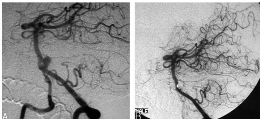
Fig 1. A and B, Pretreatment angiograms demonstrating saccular basilar artery aneurysm.