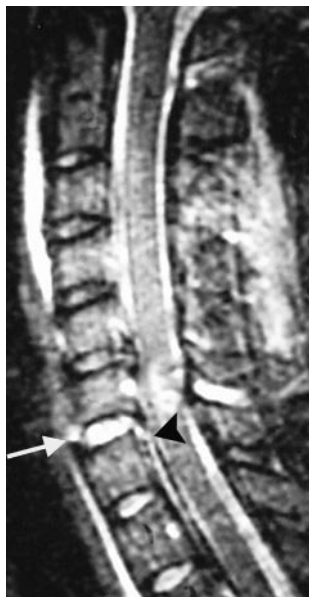
Fig 1. True-positive injuries to the ALL, disk, and PLL. Sagittal STIR image demonstrates disruption of the ALL (arrow), intervertebral disk, and PLL (arrowhead) at C6–7. Injuries were confirmed at surgery.