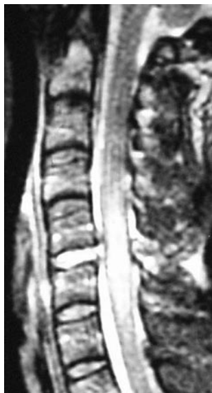
Fig 6. False-negative ALL. Sagittal fast spin-echo T2-weighted image demonstrates widening of the intervertebral disk and disruption of the PLL at C5-6, which were confirmed at surgery. The ALL, however, appears intact on the MR imaging but was found injured at surgery.