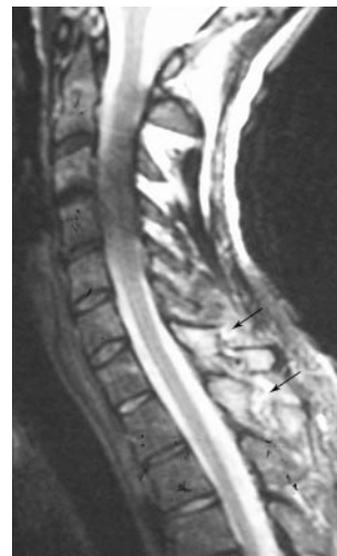
Fig 9. False-negative ligamentum flavum and true-positive interspinous soft tissue injury. Sagittal T2-weighted image shows spinous process fractures of C7 and T1 (arrows). There is increased T2 signal intensity and stretching of the interspinous ligament complex (injury confirmed at surgery). The ligamentum flavum at the level of injury appears intact on the MR imaging but was found to be injured at surgery.

interspinous soft tissues. Presence and degree of injury were identified.