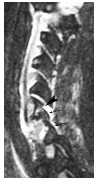
Fig 4. True-positive facet fracture-dislocation. Parasagittal fast spin-echo T2 image shows a C6 facet fracture (arrowhead) with C6–7 facet dislocation (arrows), which were confirmed at surgery.