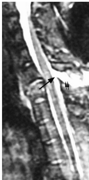
Fig 3. True-positive ligamentum flavum and interspinous ligament injuries. Sagittal STIR image demonstrates complete disruption of the ligamentum flavum (arrow) and interspinous ligament complex (paired small arrows) at C6–7, which was confirmed at surgery.