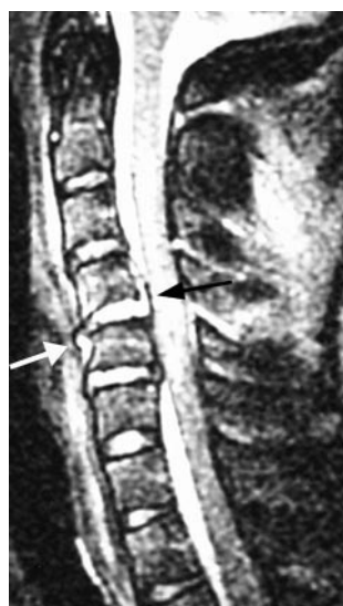
Fig 2. True-positive injuries to the ALL, disk, and PLL. Sagittal fast spin-echo T2-weighted image shows elevation of the ALL (white arrow), disruption of the intervertebral disk, and elevation of the PLL at C4–5 (black arrow). Injuries were confirmed at surgery.