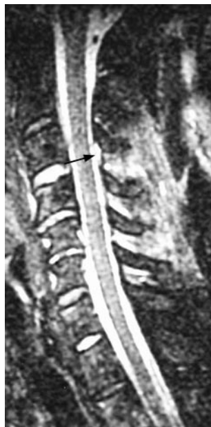
Fig 8. True-positive ligamentum flavum and false-positive interspinous soft tissues. Sagittal STIR image demonstrates disruption of the ligamentum flavum at multiple levels. Injury at the operative level C3-4 (arrow) was confirmed at surgery. On the image, there is also increased T2 signal intensity with stretching of the interspinous ligamentous complex; however, at surgery, this complex was intact.