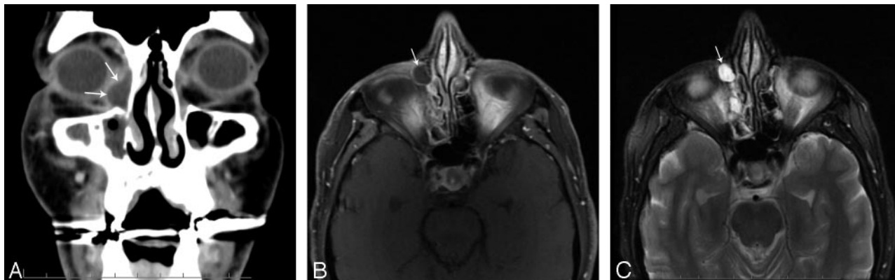
Fig 1. A 52-year-old man, status post right maxillectomy for resection of soft palate adenoid cystic carcinoma with a right dacryocystocele. A , Coronal CT. Cystic, fluid-filled structure within the anteromedial aspect of the right orbit, adjacent to the nasolacrimal duct (arrows). B , Axial T1 postgadolinium. Thin peripheral enhancement around the dacryocystocele (arrow). C , Axial T2. Appearance of a dacryocystocele as a cystic, fluid-filled structure within the anteromedial aspect of the right orbit (arrow).