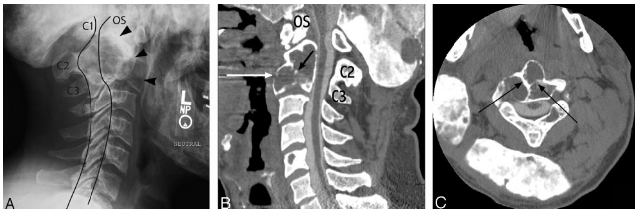
Fig 1. Lateral conventional radiograph of the cervical spine (A), sagittal postmyelogram CT reconstruction of the cervical spine (B), and axial (C) postmyelogram CT scans of this patient with a multiseptated (black arrows) C2–C3 vertebral complex (arrowheads) and disruption of the anterior wall of the vertebral body (white arrows). Note os odontoidum (OS), cord atrophy, and anterior subluxation of C1 on C2. The anterior and posterior spinal laminar lines are outlined.