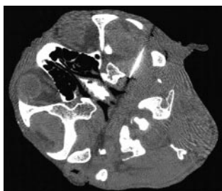
Fig 2. The needle tip is located at the target site of the mandibular nerve.