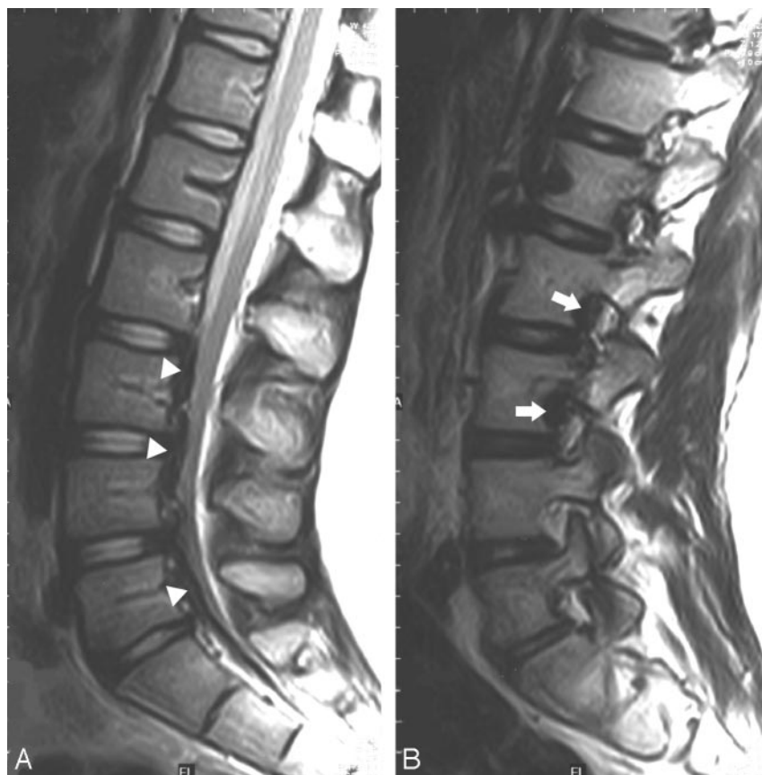
Fig 2. A, Midsagittal T2-weighted scan shows the prominent epidural venous plexus below level L2 ( arrowheads ). B, Sagittal T2-weighted image shows the enlarged veins obliterating the neural foraminae of level L2–3 ( arrows ).

may present with symptoms of lower extremity venous insufficiency or idiopathic deep venous thrombosis. 5 If the deep venous collateral system is sufficiently developed and drains