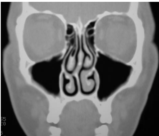
FIG 3. Coronal sinus CT of the patient obtained 10 years previously, before nasal septal reconstruction and rhinoplasty with lateral osteotomies, shows normal sinuses.

opmentally small sinus with chronic obstructive sinusitis was the cause (3). The acquired nature of this condition, however, is now well recognized. Negative intrasinus pressure has been demonstrated in patients with silent sinus syndrome (5). Obstruction of the sinus ostium is always present, but it is not clear whether this is the cause or the result of sinus wall