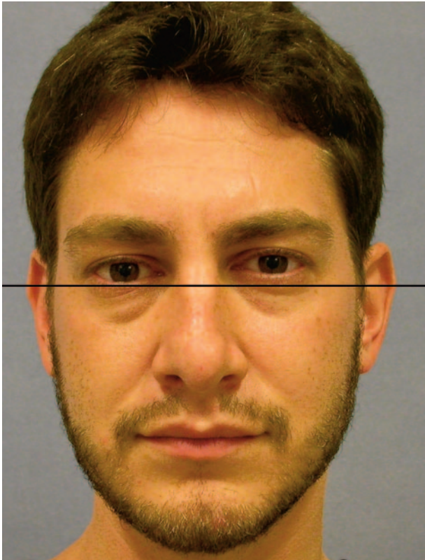
FIG 2. Frontal view of the patient, demonstrating hypoglobus and enophthalmos of the right eye.