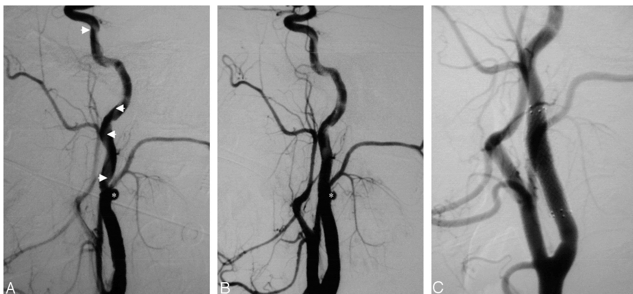
FIG 2. Patient 19.

C, Follow-up angiography at 25 months revealed a widely patent stent with no filling of the pseudoaneurysm (lateral projection).