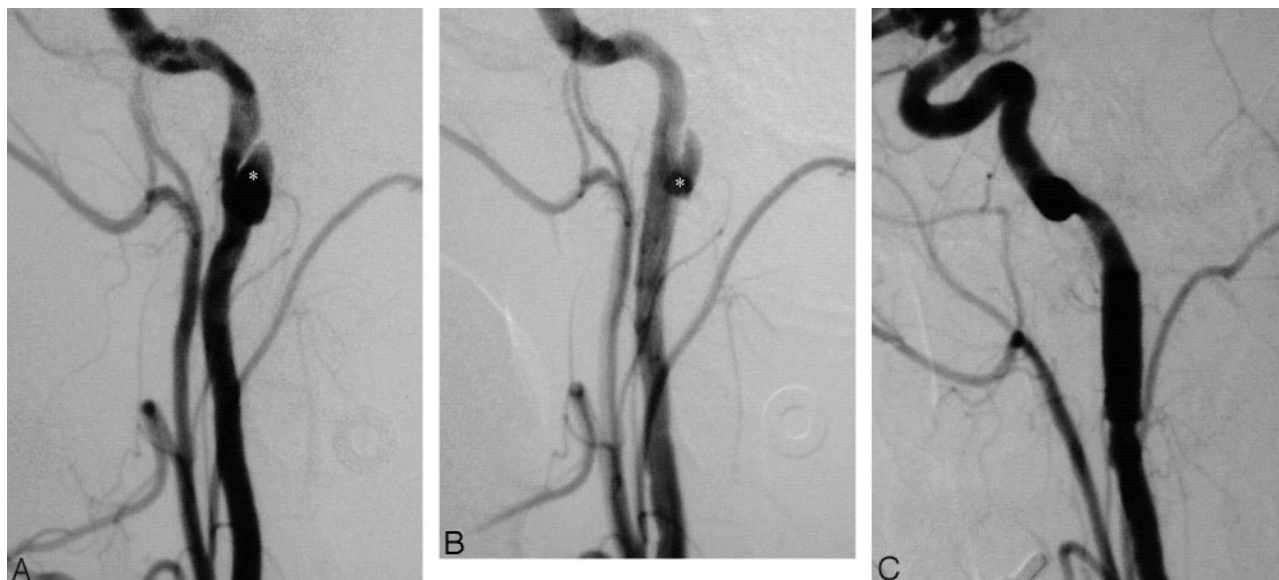
FIG 1. Patient 11.

A, Lateral digital subtraction angiography (DSA) of a 40-year-old woman with an intimal flap within the distal cervical portion of the left internal carotid artery resulting in pseudoaneurysm (windsock deformity, asterisk) and 75% stenosis.