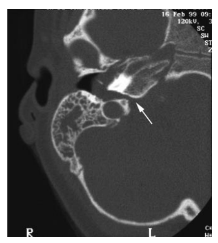
Fig 1. CT scan in the axial plane. The cleft extends between the bony labyrinth and the jugular bulb.