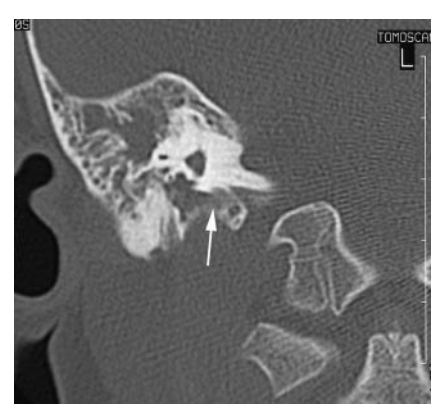
Fig 2. CT scan in the coronal plane. The cleft extends from the hypotympanum, inferior to a normal bony labyrinth, and toward the posterior fossa close to the endolymphatic sac.