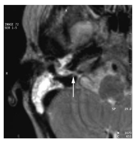
Fig 3. MR image in the axial plane obtained with a T2-weighted sequence (TE, 128 TR, 4416; NEX, 1; section thickness, 3 mm). Hyperintensity of the CSF can be seen in the medial cavity communicating with cerebellopontine angle.

tor et al (1) provided precise data on the later developmental stages of the periotic duct, as well as indirect evidence for the patency of Hyrtl's fissure. In the 16–18-week-old fetus, the fossula of the round window is continuous with the posterior cranial fossa,