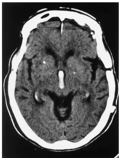
FIG 2. CT scan showing an intraventricular hemorrhage.