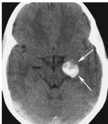
FIG 2. Follow-up CT scan. Axial CT scan shows increased hyperattenuation of the lesion (arrows), indicating acute thrombosis.

PCA aneurysms under the age of 20, seven younger than 10 years of age, and 10 presenting without subarachnoid hemorrhage. Although the angiographic appearance in one of his cases (case 1) is somewhat similar to ours, closed head injury or minor head trauma was not noted as a possible cause. De Sousa et al (10), who described a ruptured nontraumatic giant PCA aneurysm, found only 10 previously published cases in children 5 years of age or younger.