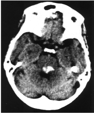
FIG 1. Dorsal PPH.

CT scan in a 65-year-old man who was alert on admission, with mild gait ataxia. Hematoma volume is 2.5 mL. Patient outcome was excellent (GOS score 5).