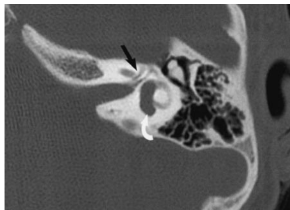
FIG 1. Case 1, 6-year-old girl evaluated for mixed hearing loss, worse on the left side. Axial 1-mm section at the superior aspect of the left internal auditory canal (IAC) shows two canals coursing anteriorly in the expected location of the labyrinthine segment of the facial nerve (arrow). Note also the dilated posterior semicircular canal (curved arrow).

On the right side, the labyrinthine portion of CN7 appeared normal, although the proximal tympanic segment was asymmetrically thickened. Two tympanic segments of CN7 were clearly identified in the coronal plane, one coursing in the