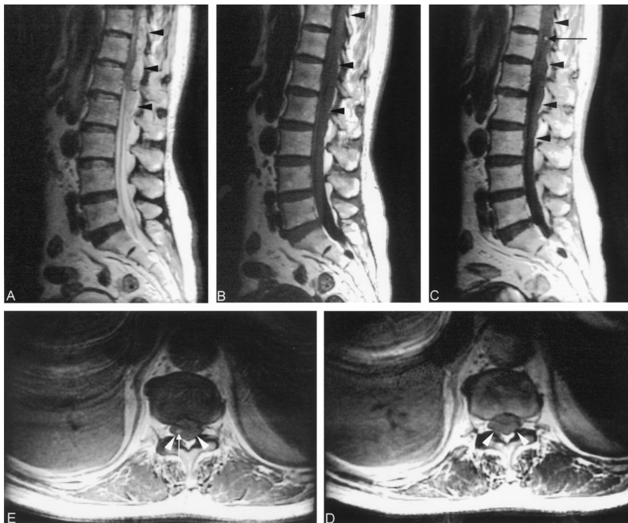
FIG 1. Case 1, a 69-year-old woman. MR images of the thoracolumbar spine, obtained 10 hours after sudden-onset severe back pain, show a large SEH in the dorsal area of T9–L3.

A, Sagittal T2-weighted (2000/80/2 [TR/TE/NEX]) image shows the hematoma as a heterogeneously hyperintense area (arrows).