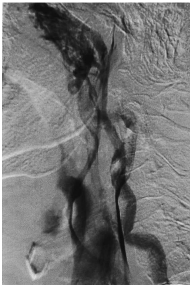
FIG 2. Venous-phase angiogram shows the pterygoid plexus, maxillary veins, facial vein, and retromandibular-external jugular vein channels.

Although transarterial detachable balloon occlusion may be a quick, efficient, and safe method for occluding most direct carotid cavernous fistulas and although it remains the preferred treatment of choice to close direct carotid cavernous fistulas, it is not without complexities, limitations, and complications. The transvenous access to the cavernous sinus offers an alternative route and has supplanted transarterial embolization of dural feeders originating from the external carotid artery or the ICA, for indirect (or dural) arteriovenous fistulas of the cavernous sinus (dural carotid cavernous fistulas). Transvenous embolization for direct carotid cavernous fistulas has been primarily used in cases in which transarterial access has been impossible because of unfavorable position or size of the ostium of the fistula or unfavorable slow-flow characteristics of the fistula, both of which imply unfavorable mechanical characteristics of