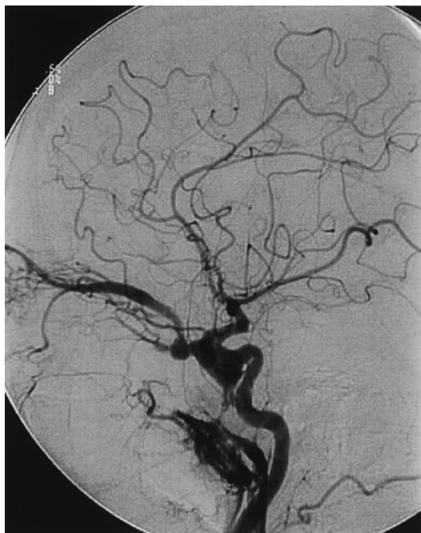
FIG 1. Lateral-projection angiogram of the left common carotid artery shows a direct carotid cavernous fistula, with the ostium in the inferior C4 portion of the ICA just anterior to the posterior genu. Fistulous flow to the cavernous sinus, with effluence to an attenuated superior ophthalmic vein, a single channel connecting to the pterygoid plexus, is present. No inferior petrosal sinus opacified.

orbital fissure and with the anterior facial vein via a deep facial branch (18). In our patient, the retromandibular and facial systems opacified from the venous effluence from the pterygoid plexus. Once thought to indicate possible posterior obstruction of the cavernous sinus, angiographic visualization of the pterygoid venous plexus is both common and normal. A review of our available case material from 1980 through 2000 revealed that the pterygoid plexus was visualized in 25 (29%) of 86 direct carotid cavernous fistulas.