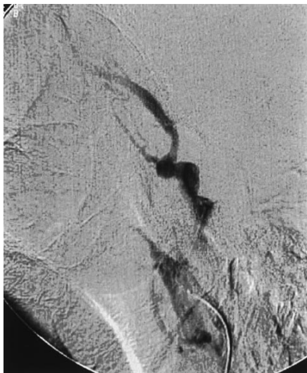
FIG 3. Rapid Transit microcatheter has been passed into the cavernous sinus via the pterygoid plexus. Injection of contrast medium shows the venous compartment.