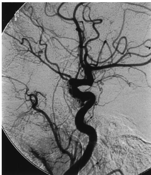
FIG 4. Injection of the left common carotid artery after placement of standard and fibered GDC shows complete occlusion of the fistulous flow.

transvenous approach was attempted. Because of the precarious visual function and marked increase in intraocular pressure, the two-balloon method, requiring occlusion of the ICA beyond the fistula, maximiz-