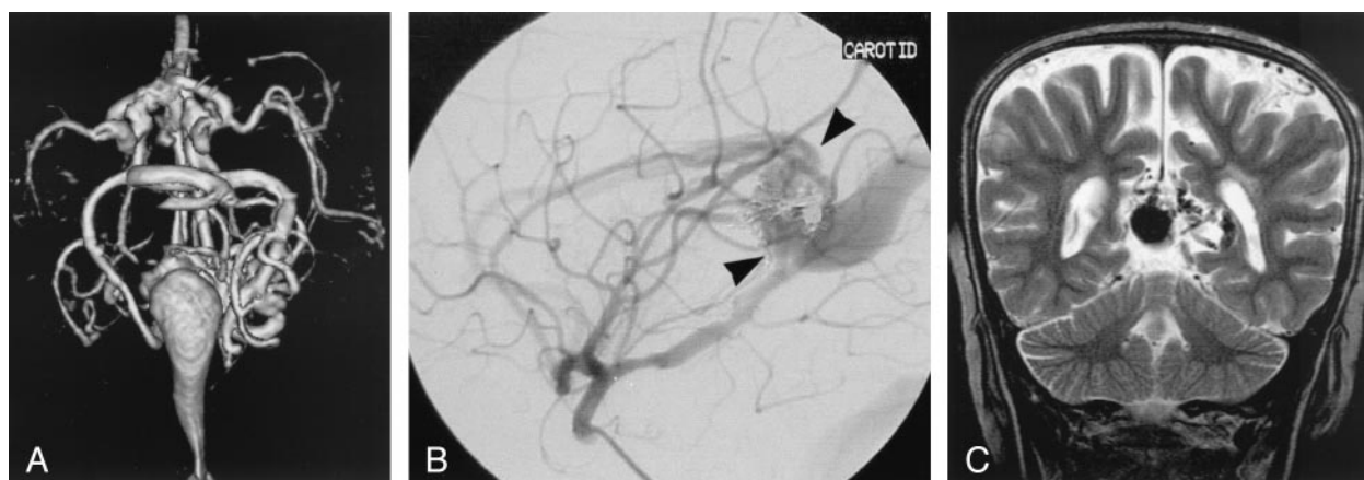
FIG 2. Images from the case of a 3-month-old triplet with worsening congestive heart failure.

A, Volume-rendered MR angiogram shows, from an inferior prospective, the arterial feeders supplying the lesion from the left side (arrows).